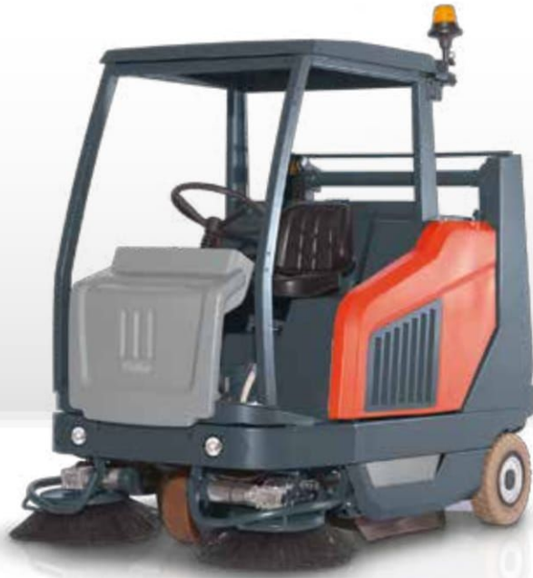
Sweepmaster P1500 RH with optional cab safety roof