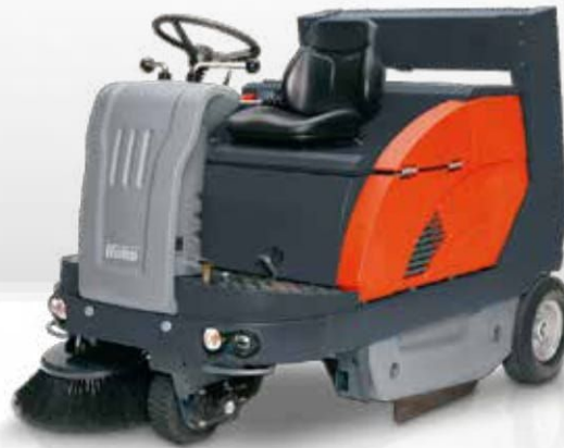
Sweepmaster P1200 RH