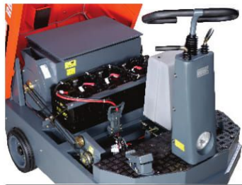
Four heavy duty deep cycle batteries provide extended run time and increased productivity.

RELIABILITY: Rugged, High quality build, robust construction and essential mechanics ensure reliability.