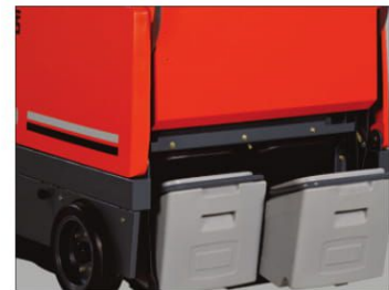
Easy to remove and dispose dual hoppers.