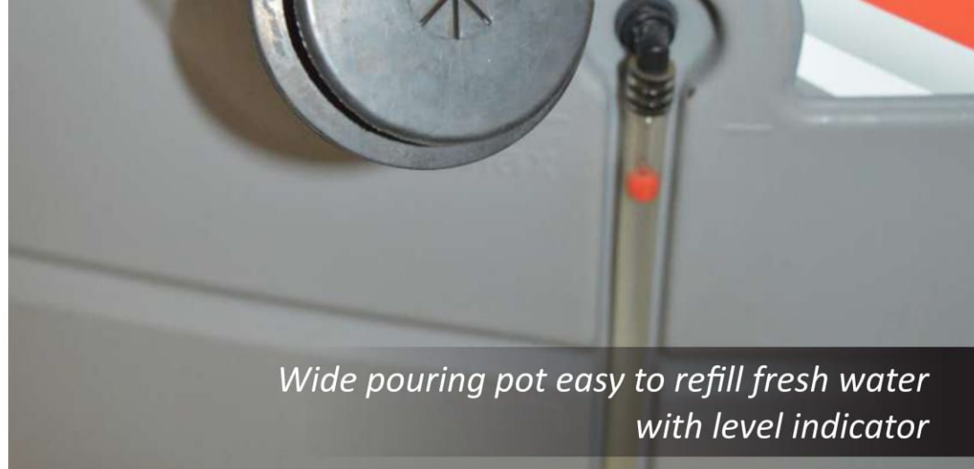
Wide pouring pot easy to refill fresh water with level indicator