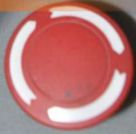
Emergency stop push button