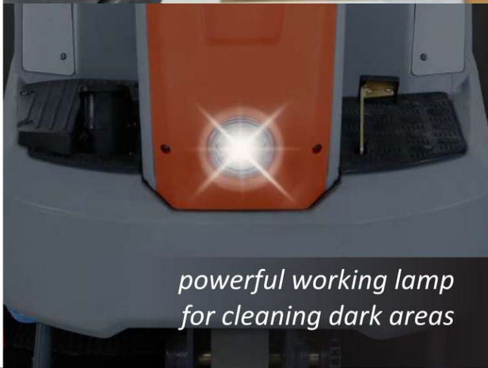
powerful working lamp for cleaning dark areas