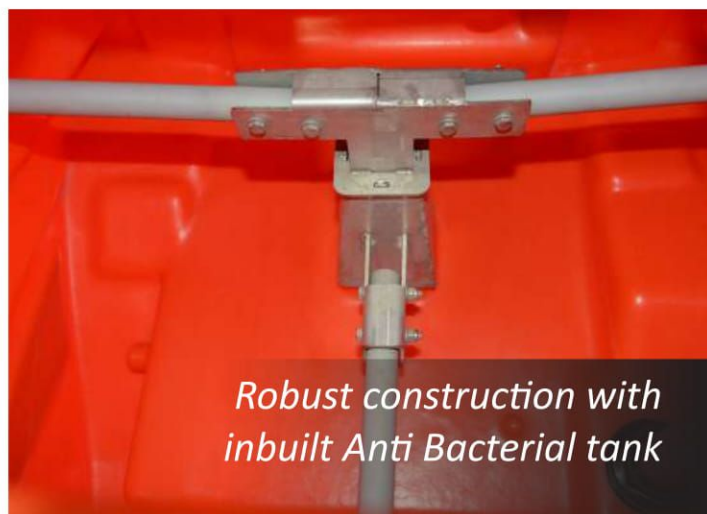
Robust construction with inbuilt Anti Bacterial tank