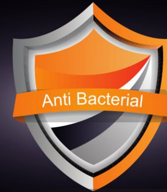
Anti bacterial tank has special coating that prevents the build-up/growth of bacteria