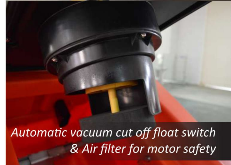
Automatic vacuum cut off float switch & Air filter for motor safety