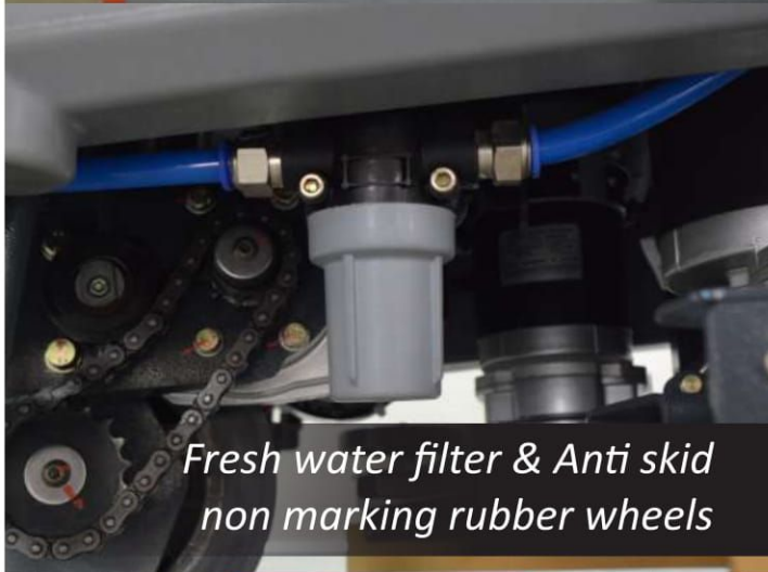
Fresh water filter & Anti skid non marking rubber wheels