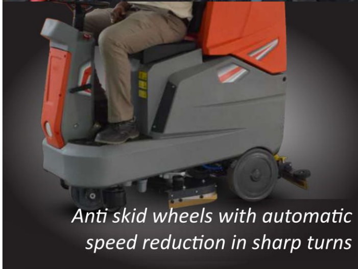
Anti skid wheels with automatic speed reduction in sharp turns