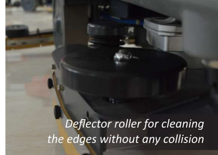
Deflector roller for cleaning the edges without any collision