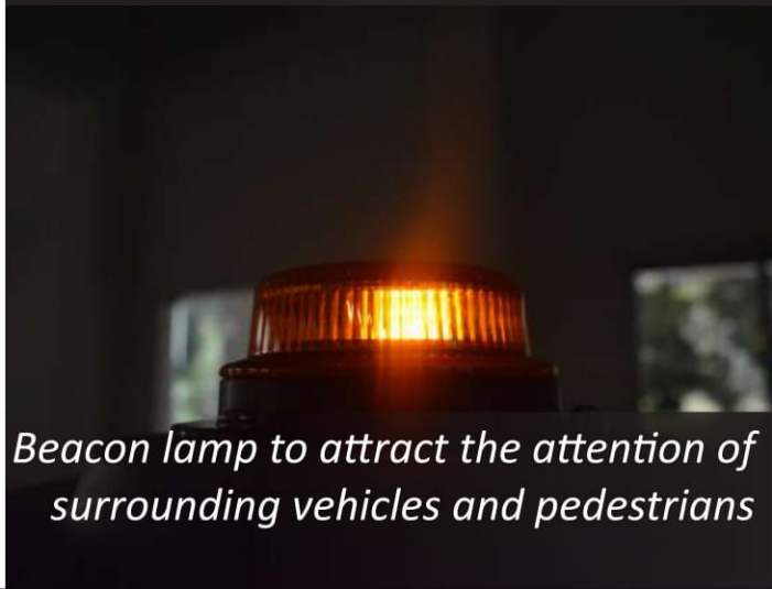
Beacon lamp to attract the attention of surrounding vehicles and pedestrians