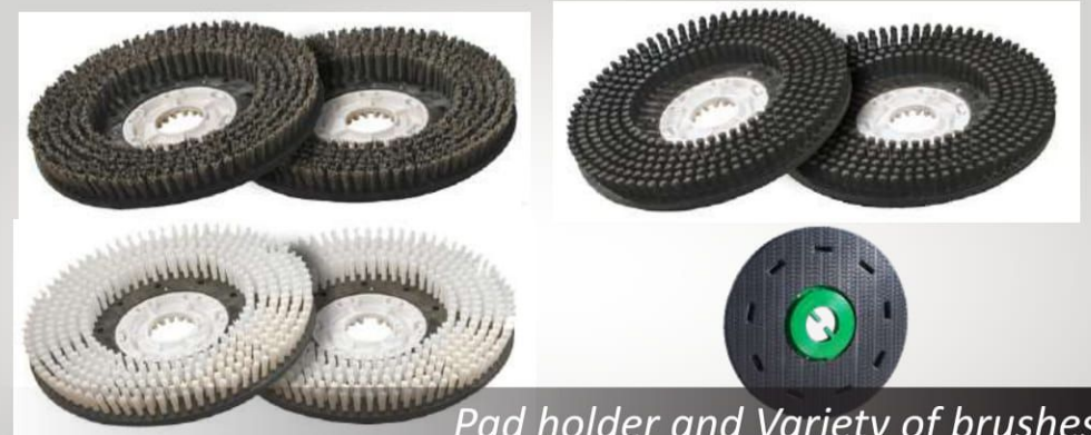
Pad holder and Variety of brushes available for different type of floors