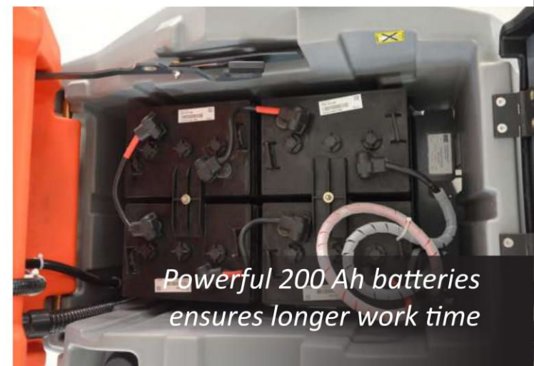
Powerful 200 Ah batteries ensures longer work time