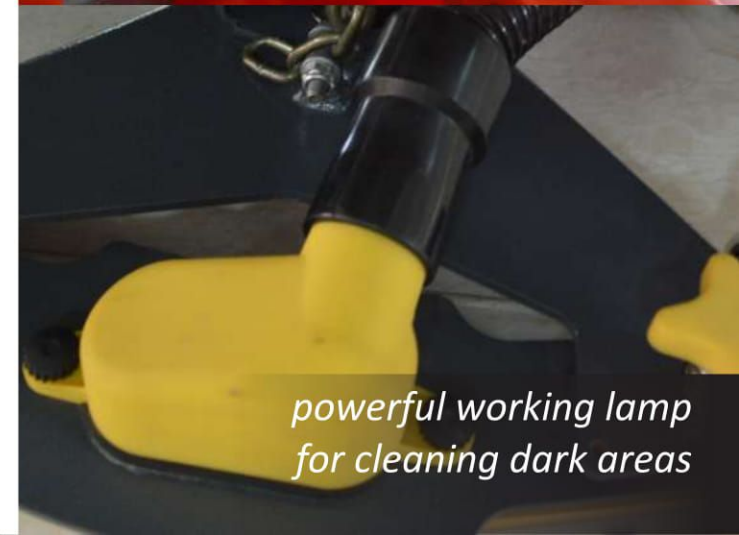
powerful working lamp for cleaning dark areas