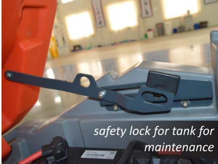
safety lock for tank for maintenance