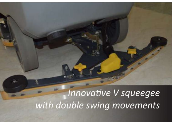
Innovative V squeegee with double swing movements