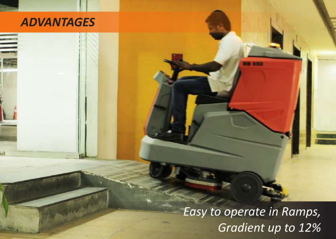
Easy to operate in Ramps, Gradient up to 12%