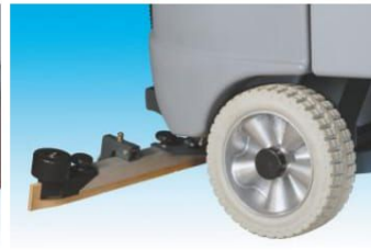
Large Anti Skid wheel for safe driving and operation on any floor.