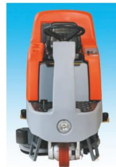
Centrally placed wide angle head lamp for good visibility while operating in low lit areas.