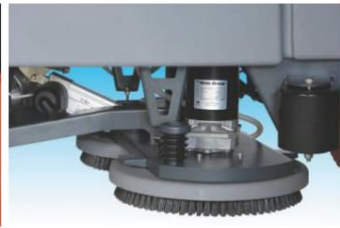
Brush release by foot. No tools required.