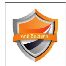
Anti bacterial tank has special coating that prevents the build-up / growth of bacteria.