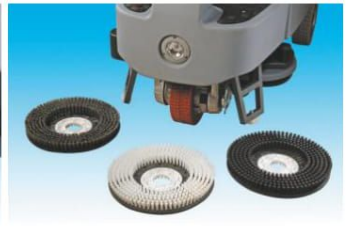
Variety of brush options available to suit different floors.