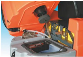
Dirt water tank can be easily cleaned - thanks for the easy accessibility and large opening.

Battery Operated Ride On Scrubber Drier • Choice of high traction batteries • Running Hours from 3 to more than 5 hours • Soft touch control panel • Provision for holding bottles, log book, manuals etc., as standard, close to the operator • Large Tanks for un-interrupted cleaning performance • Change of brushes and squeegee lips needs no tools • Break away Squeegee • In built fault diagnosis system • Reverse alarm • Head Lamp • Large Anti Skid Wheels