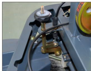
Easy access to broom adjustment system