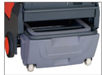
Take it easy hopper with Hopper locking mechanism