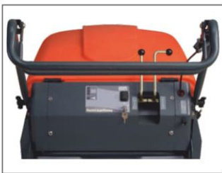
Easy to use controls. Ergonomic handle, Helps to make the turn without much effort